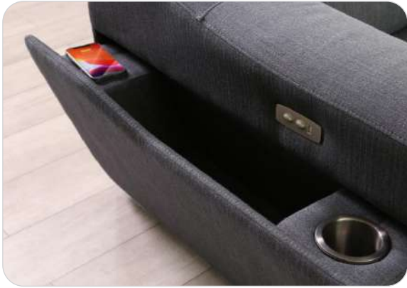
Arm Storage Pocket with Wireless Charger and Cupholder